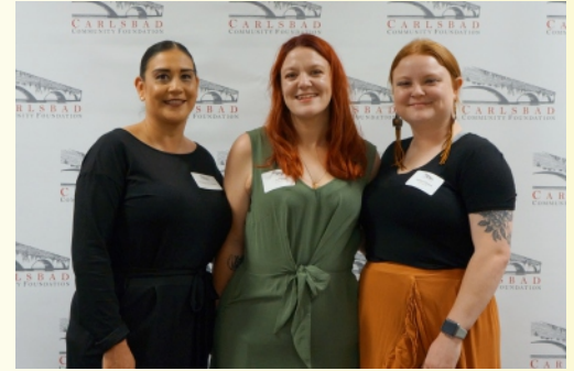
Eddy County CASA