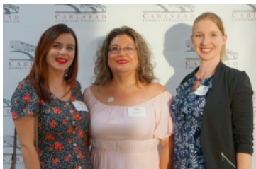
Carlsbad MainStreet / LifeHouse