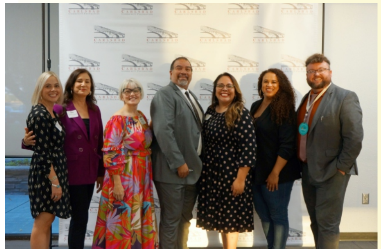
Boys & Girls Club of Carlsbad